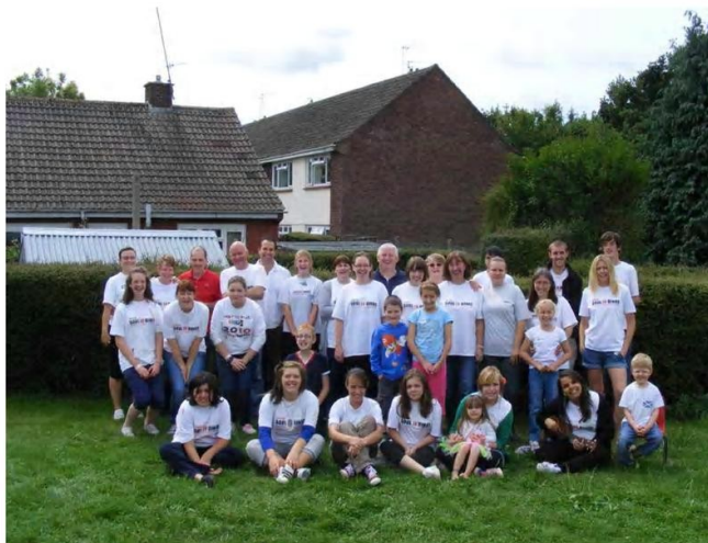
Some of the team, posing for a group photo!

In the summer holidays, the churches of Dinas Powys came together to hold an event called Soul in Dinas action week. Soul in Dinas started in 2005 when two young people from different churches decided to do a lot more for the community.