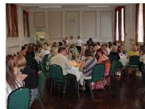
Enjoying the meal.

The date was June 21 st and what a beautiful evening it was! The staff dressed up for the occasion, wearing lovely dresses and smart suits. 54 staff came and enjoyed themselves. It is said that the compliments keep coming!