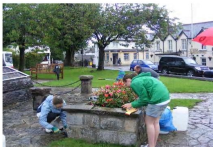
The Soul in Dinas team working so hard

This year, Dinas Powys Community Council invited Soul in Dinas to clean the stone pillar stumps and paint the black metal chains around the war memorial in the village square. This was a very important job that the team completed with pride.